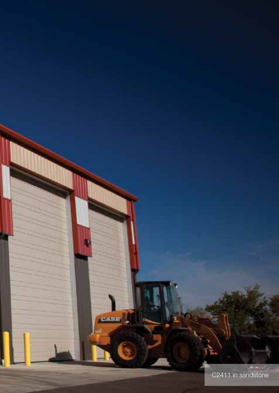
C2411 in sandstone