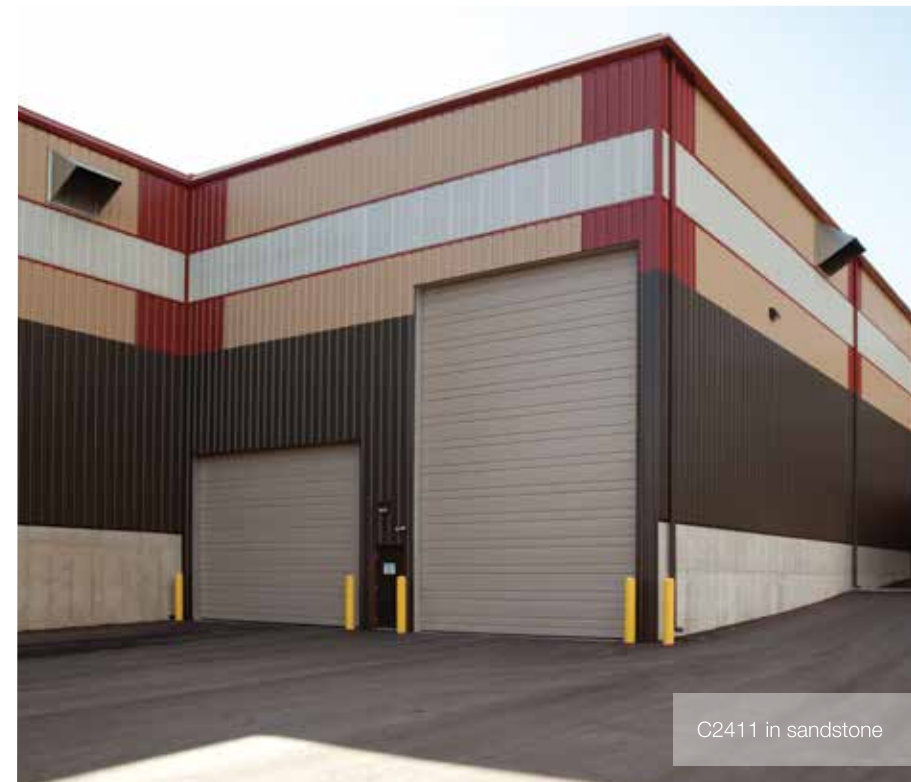
C2411 in sandstone