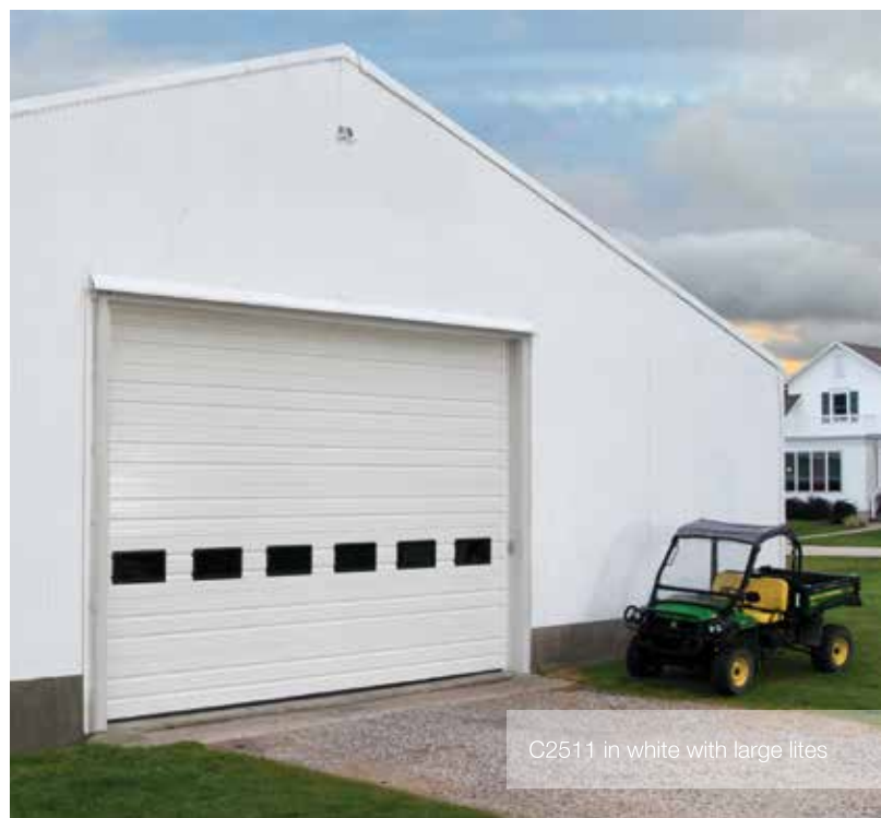
C2511 in white with large lites